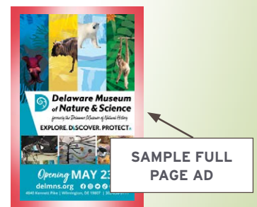
SAMPLE FULL PAGE AD